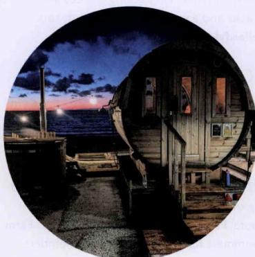
The bijou sauna, Kishtey Cheh, Isle of Man

stone staircase and looking out to Northern Ireland, to the mountains of Mourne. For those in search of post-sauna beach snacks, The Cosy Nook café and Foraging Vintners