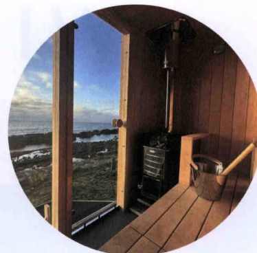
Beside the tidal pool at Cellardyke

followed by two barrel saunas. Bathers pay for an hour's sauna session, but can stay to swim and relax by the lakes all day. There is also a six-acre campsite, ideal for tents and small campervans, while other spaces offer paddleboarding and kayaking (you need to bring your own), and lessons for those who want them, and one lake is lit for winter morning and evening swimming. Also on offer are wellness weekends, sound bath sessions, meditation, moon swims with fire pits, yoga, breath work, ladies' skinny-dipping sessions, a café open from Wednesday to Sunday – and even a choir. poolbridge.co.uk