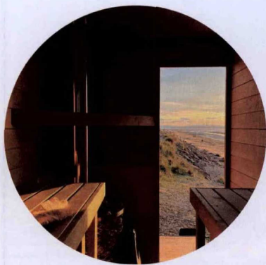
Watershed at East Findhorn Beach

which runs retreats and swim tours and boat trips around the islands. She knows all the beauty spots, and servicing them with a mobile sauna was a natural next step. What she has created is the very definition of a wild sauna – often there are no toilets or running water – but that doesn't stop bathers who like their nature raw. Saltbox is touching down permanently on North Uist and is sure to pop up on other islands soon. saltboxsauna.co.uk