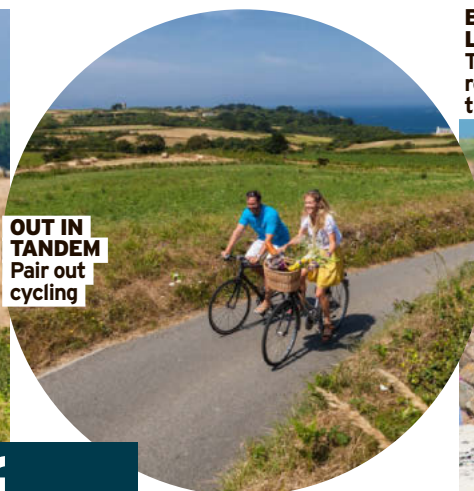
OUT IN TANDEM Pair out cycling