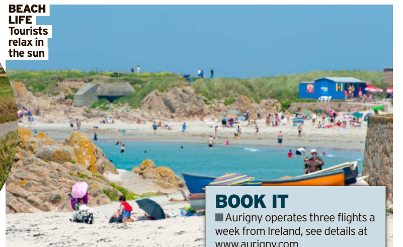
BEACH LIFE Tourists relax in the sun

don't fall foul of the local law. There's a small stone cell that looks like an Irish monastic beehive. It's the old Herm prison and was still in use until very recently, we were told.