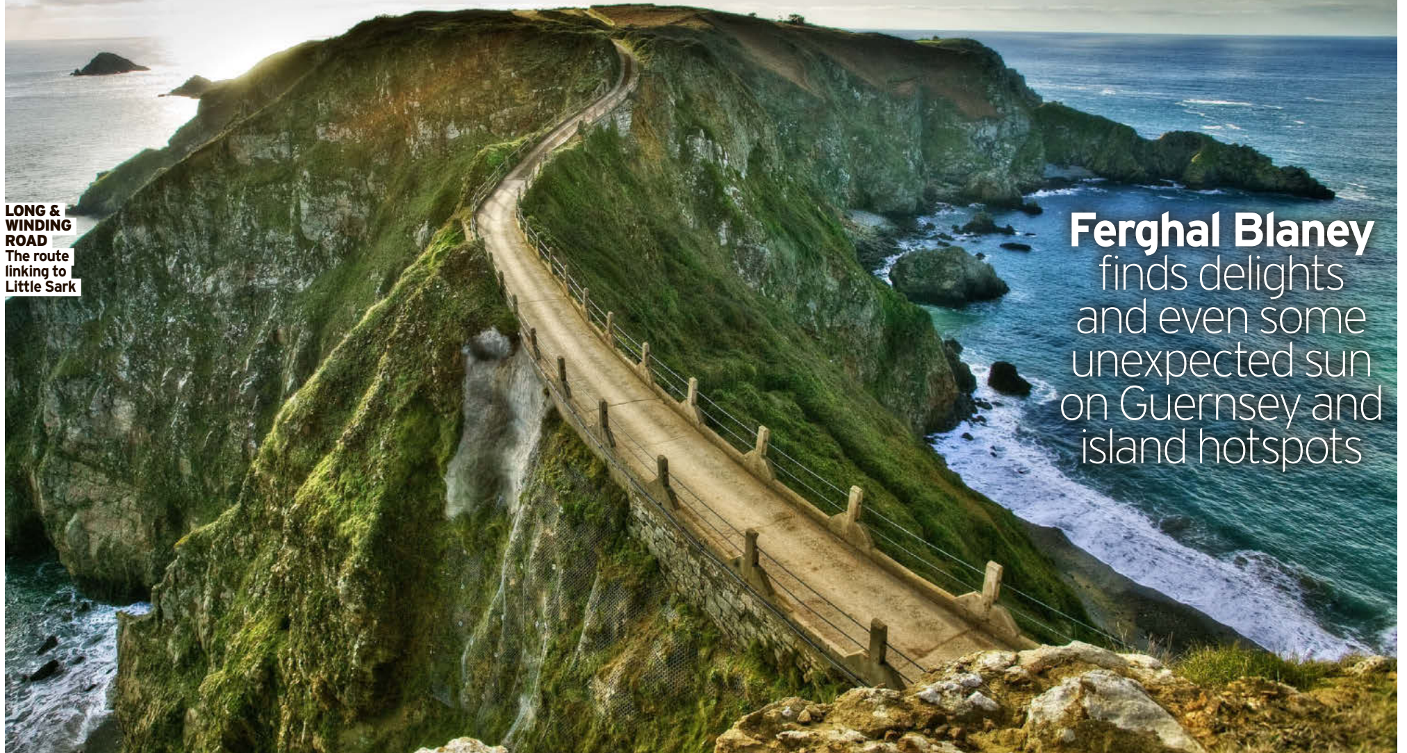
LONG & WINDING ROAD The route linking to Little Sark

Ferghal Blaney finds delights and even some unexpected sun on Guernsey and island hotspots