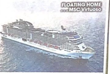
FLOATING HOME ... MSC Virtuosa