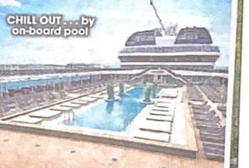
CHILL OUT ... by on-board pool