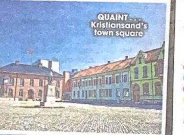
QUAINT ... Kristiansand's town square