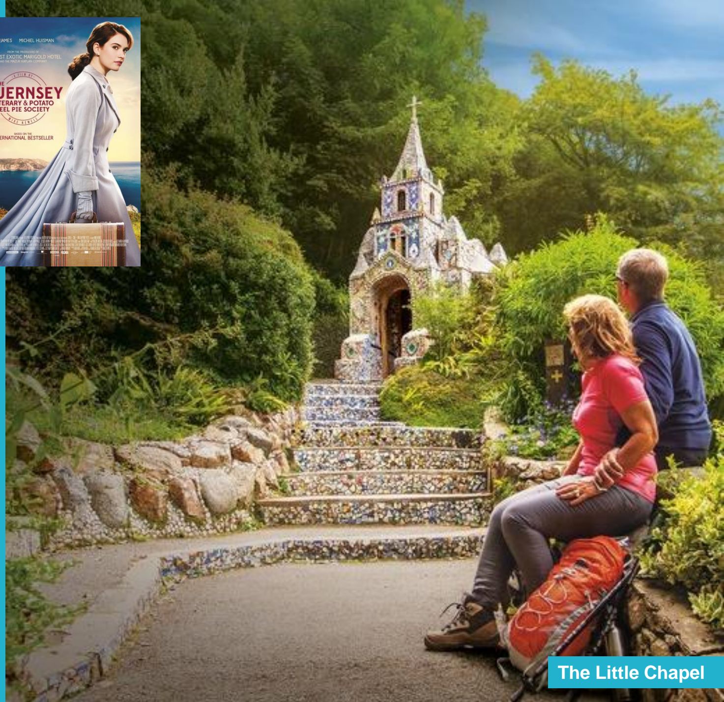
The Little Chapel